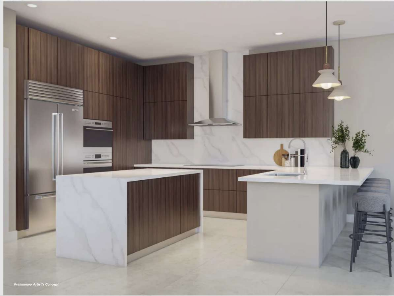
Preliminary Artist's Concept