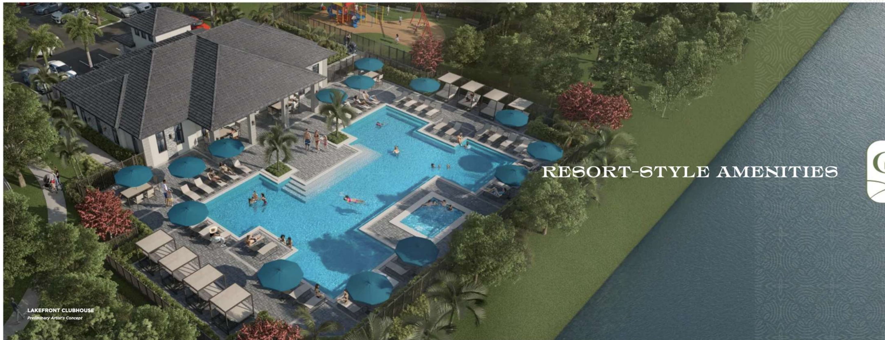
LAKEFRONT CLUBHOUSE Preliminary Artist's Concept