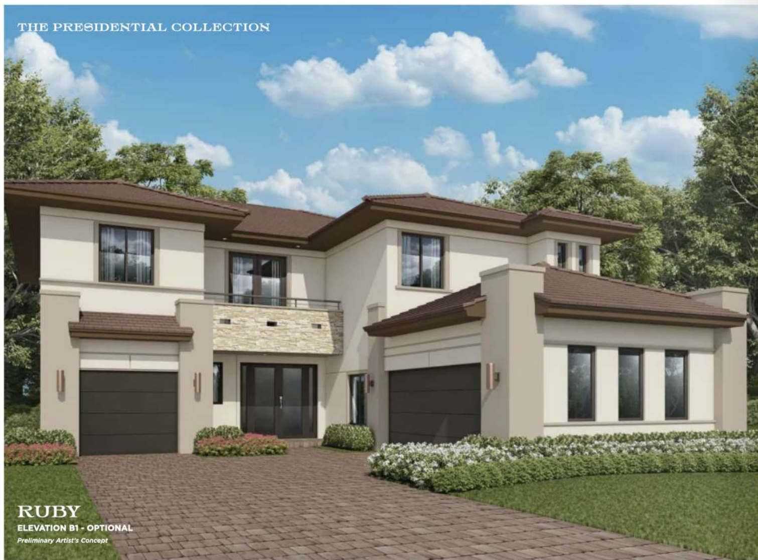
RUBY ELEVATION B1 - OPTIONAL Preliminary Artist's Concept